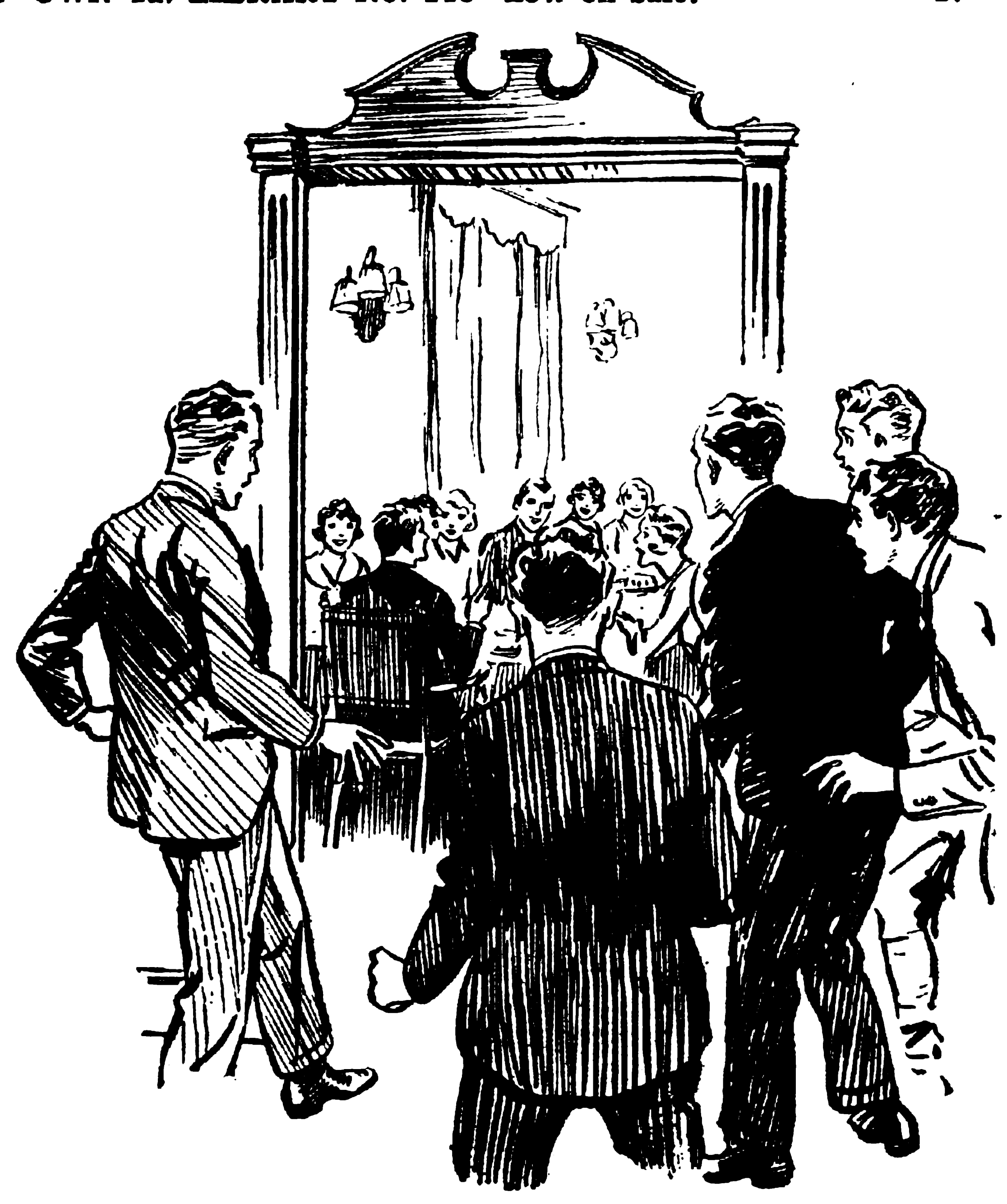
The St. Frank's juniors stared in amazement. Handforth was seated at the head of the table in the dining-room, surrounded by a crowd of laughing girls !

"You can't blame the show for that," put in Nipper. "I was having a talk with Mr. Wilcox, and he tells me that the show is