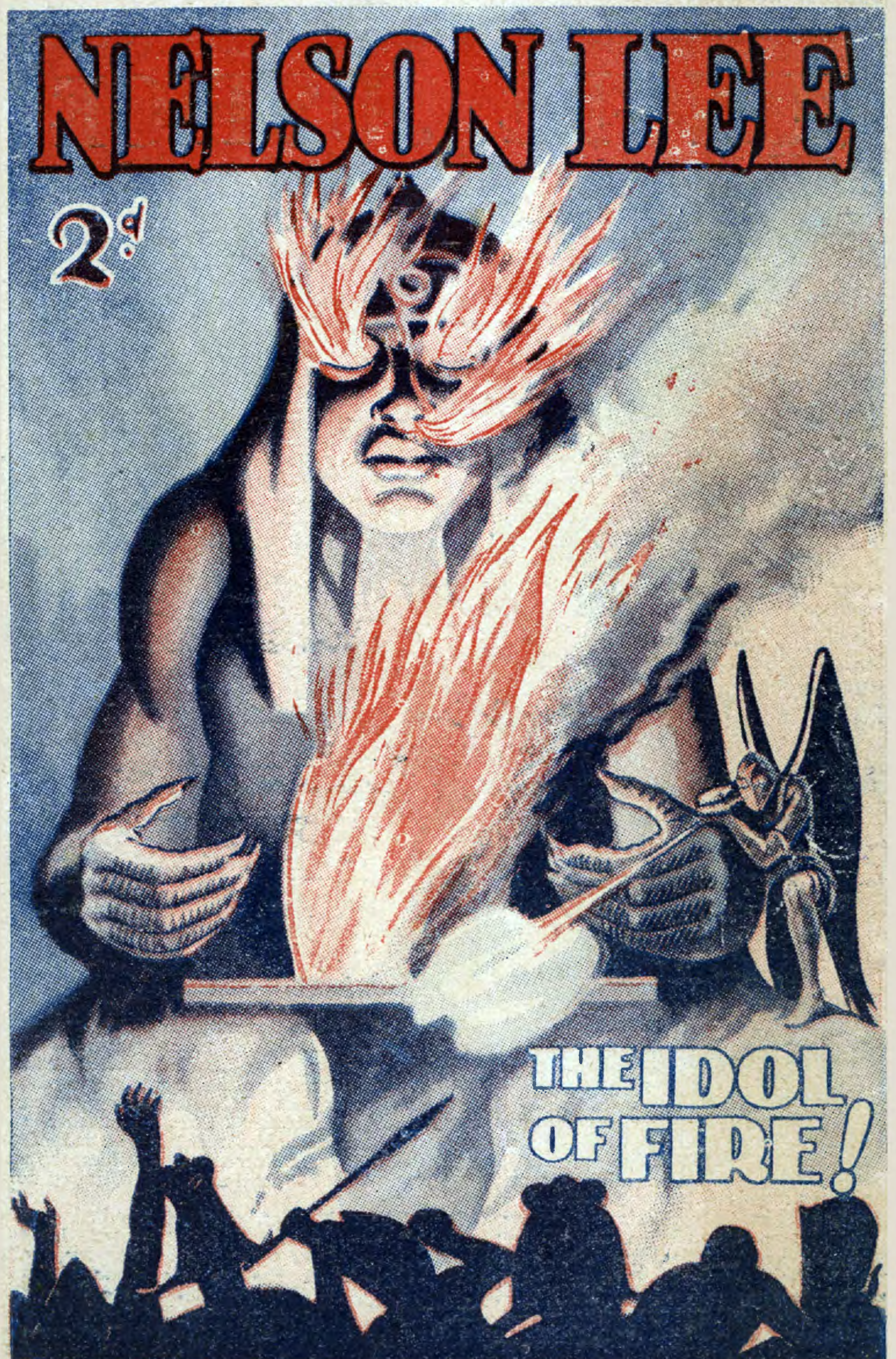
Super thrills abound in this week's complete yarn of amazing adventure featuring the Night Hawk. New Feries No. 64. OUT ON WEDNESDAY. April 11th, 1931.