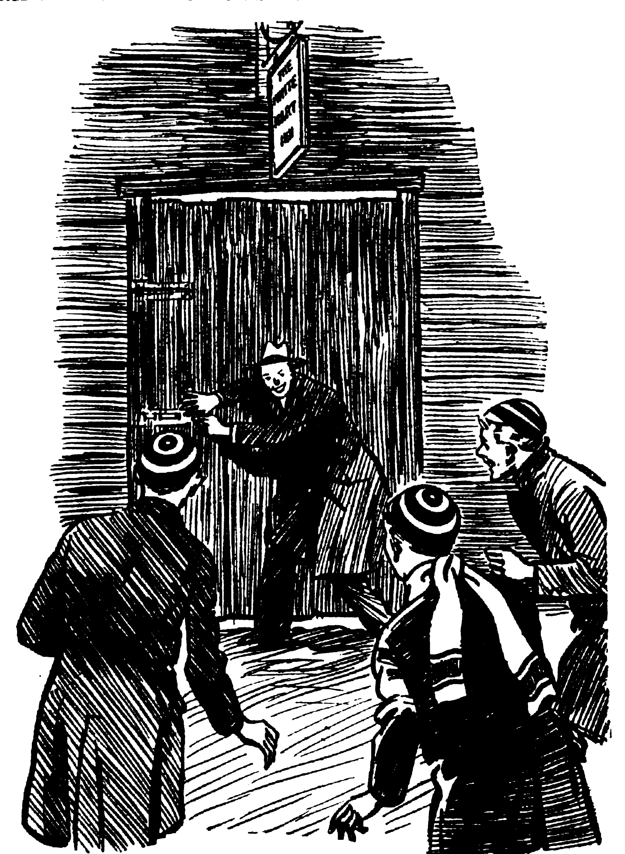
As the last of the Bright Young People passed into the barn, Clarence closed the door and barred it. "It's worked, you chaps!" he yelled triumphantly, to the St. Frank's fellows.

HE sight-seeing tour was forgotten. Handforth bundled Joy into his Morris Minor again, and drove back into Hovetown. The coach turned, and the St. Frank's fellows went back into Hovetown, too.