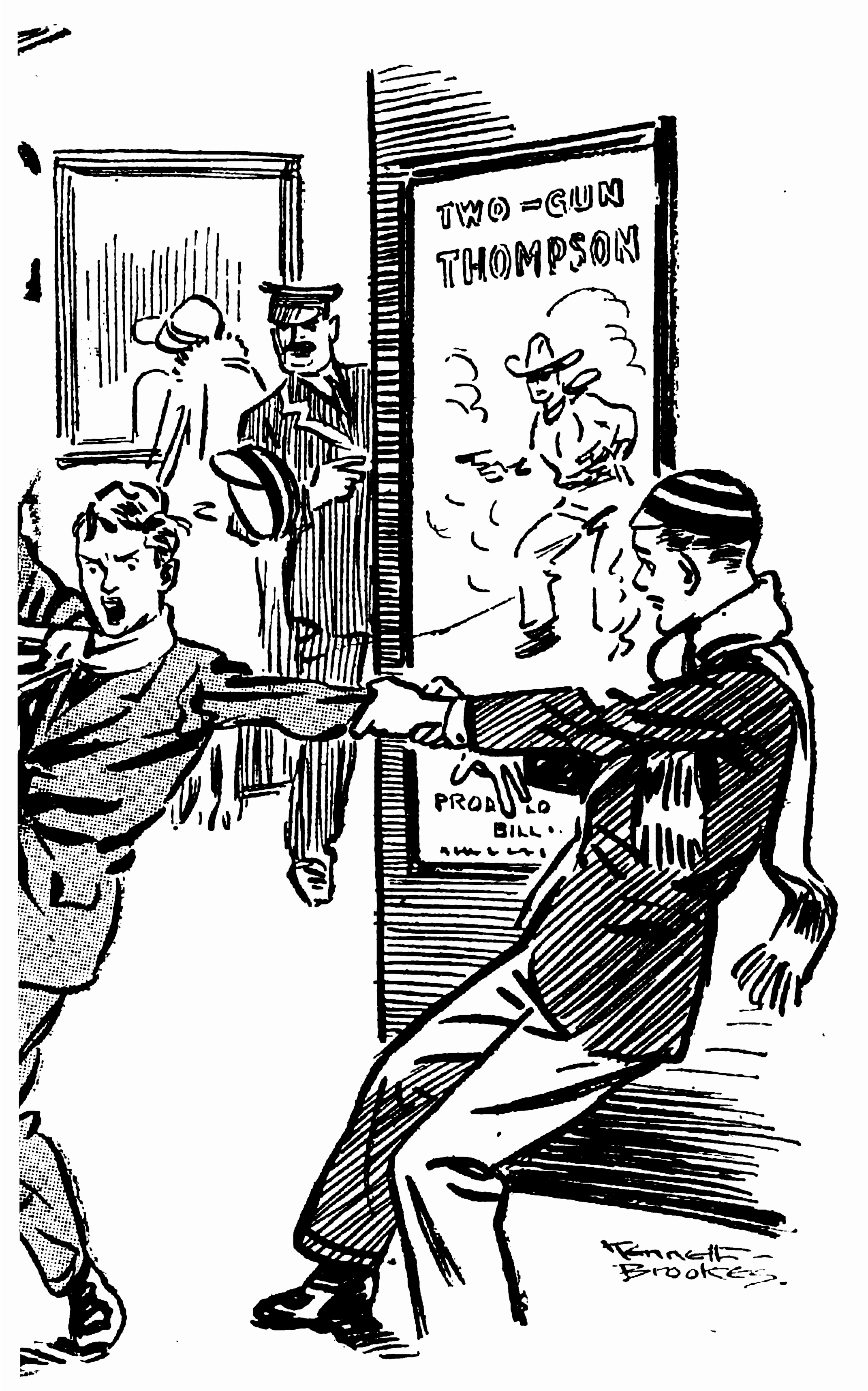
na; McClure wanted him to go to another—and Church acting as the rope!

Handforth. "Now, look here-I don't want to be a nuisance, but I believe we St. Frank's chaps can help you—if you'll let us."